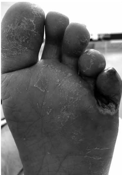
Figure 1. Ulcerated and cyanotic lesion of the second left toe.