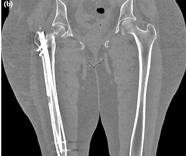
Figure 1. Appearance before and after intramedullary nailing.